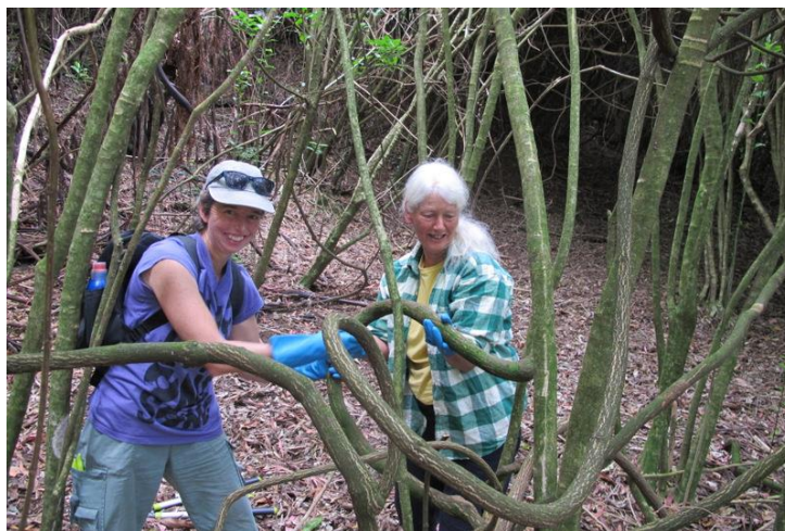
A working bee in Pohara along the slope, behind the houses of Abel Tasman Drive dealt with 732 vines in one morning. Here a large old man's beard is being dismantled. Project III.

We are in the same situation as Project 1 – see above – with the funding finishing in 2015. We had some monies left after the third year and will continue until it runs out – probably late this year.